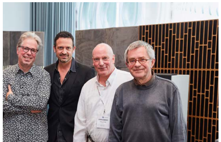
Kritikertrio zusammen mit Till Brönner