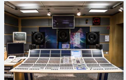
Monitoring desk

Listen to the original master files of a recording session, just like the sound engineer. This is as close it gets to the original recording.