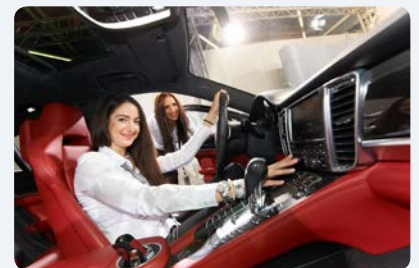
Exceptional sound systems in cars > Bild herunterladen picture download