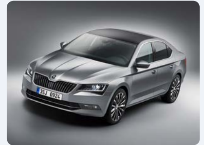
CANTON sound system Škoda Superb > Bild herunterladen picture download