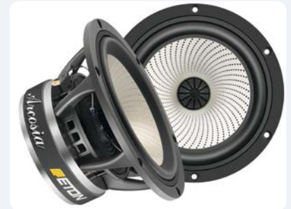
ETON Ariosa Automotive competence

Volkswagen has two new sound systems in their range in time for the HIGH END 2015: the Dynaudio Confidence Soundsystem in the new Passat with 10 Dynaudio speakers, DSP sound adjustment and a 10-channel 700 watt digital amplifier. The Golf R and the Golf GTI with the Dynaudio sound system are also new. With 400 watt digital amplifiers, 9 Dynaudio speakers including subwoofers and individual DSP sound adjustment, this sound system is expected to be amongst the best sound systems in the entire compact vehicle category.