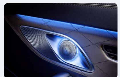
Burmester sound system