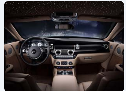
ETON sound system Rolls Royce Wraith