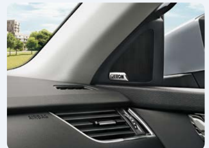
CANTON sound system > Bild herunterladen picture download