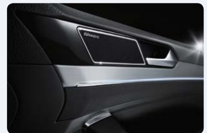
Dynaudio sound system VW Passat