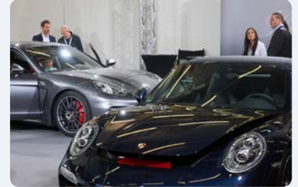
HIGH END ON WHEELS

"The optimum in sound has been achieved when you stop thinking about it" commented Dieter Burmester. As part of the HIGH END trade show, Burmester is inviting visitors to a personal demonstration in premium vehicles.