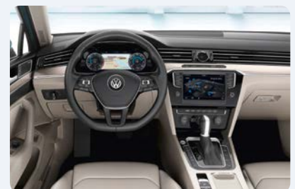
Dynaudio Soundsystem VW Passat