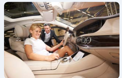
Listen and wonder