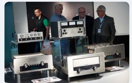
High End Products