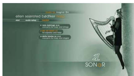
(screen shot blu-ray audio menu)

Does the HIGH END® 2009 presents the potential recording media of the future? It's the "Pure Audio Blu-ray Disc". The HIGH END SOCIETY presents "new media" at the M,O,C, Atrium 3, room D 111.