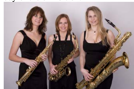
(Newton meets Saxsisters)

The HIGH END SOCIETY would like to surprise our visitors and exhibitors with musical interludes in the form of a walking act, which will be a treat to the ears on every day of the exhibition.