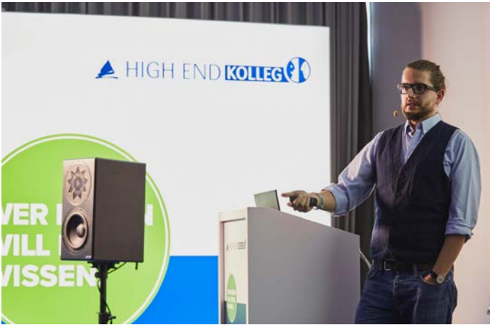
HIGH END KOLLEG